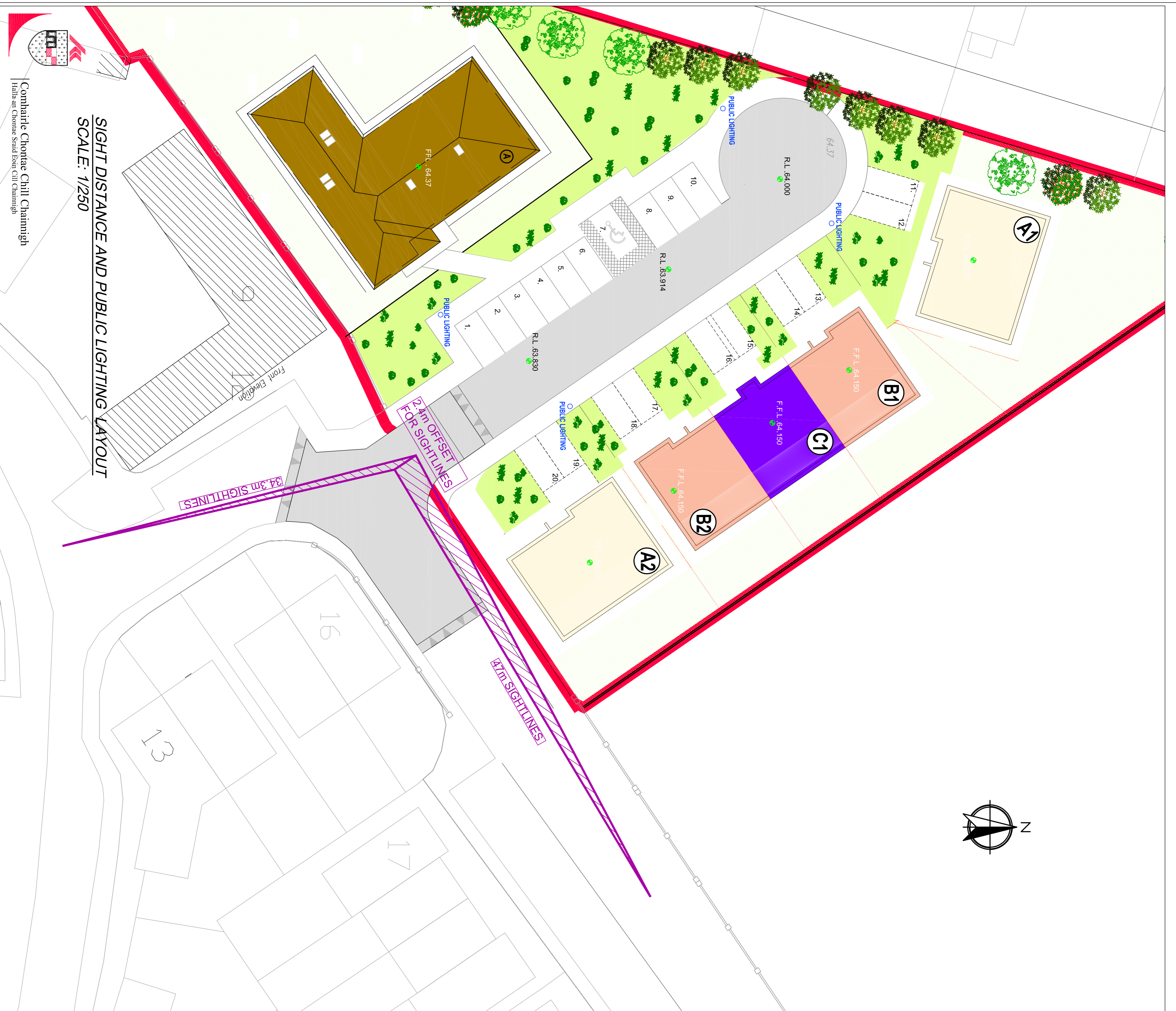
SIGHT DISTANCE AND PUBLIC LIGHTING LAYOUT SCALE: 1/250

Comharle Chonrae Chill Chainnigh Halls and Chonrae Stand East, Chill Chainnigh