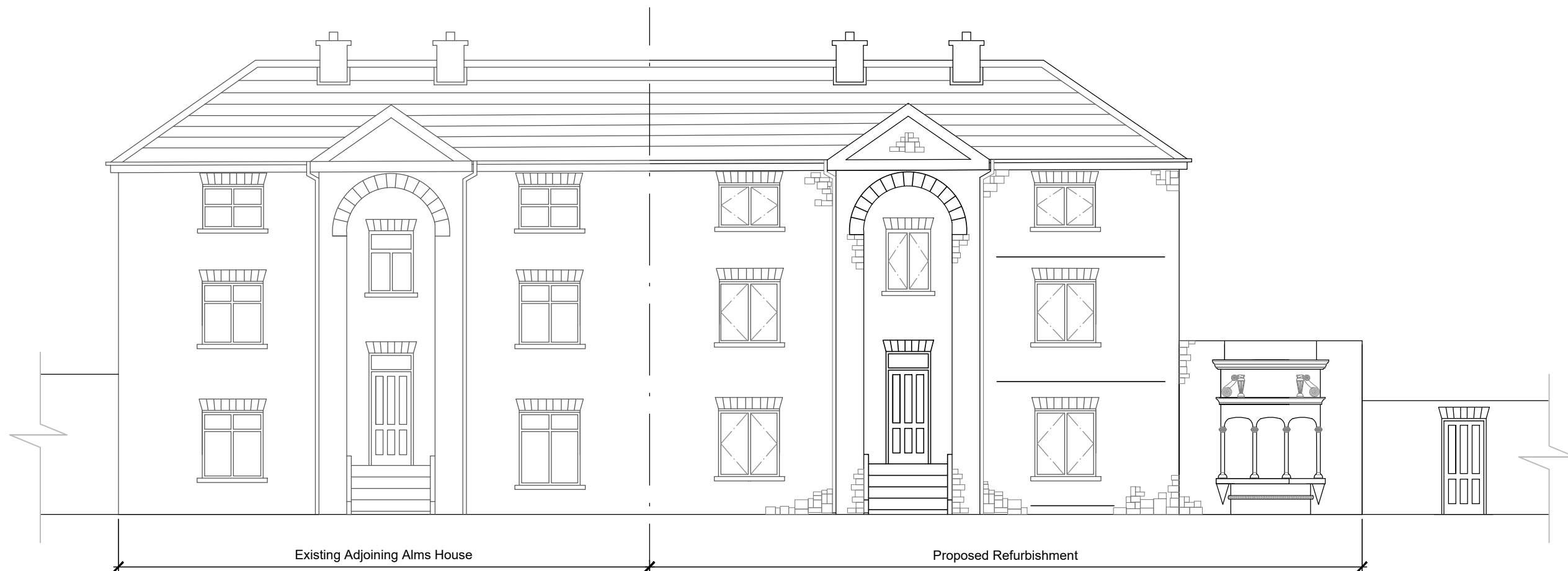
Front Elevation. Scale, 1:100.