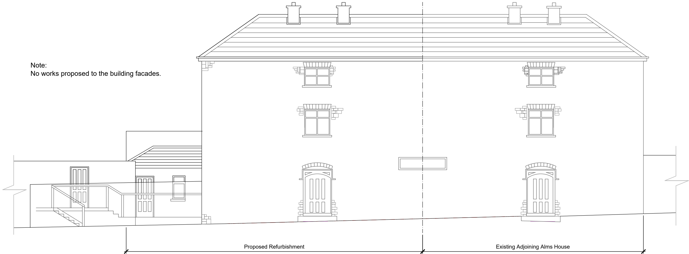
Rear Elevation (on St. Mary's lane). Scale, 1:100.

Note: No works proposed to the building facades.