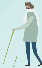
Accessibility and Social Inclusion