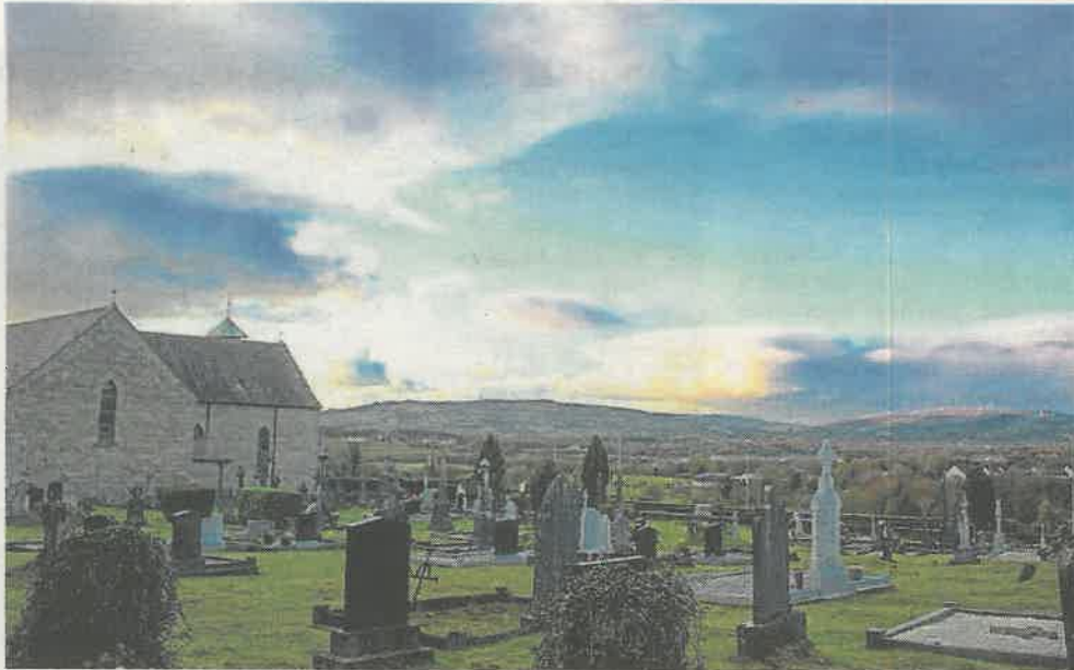
Kilkenny County Council heard there had been 26 applications for graveyard grants - €23,000 was the amount expected to be available but due to the impact of Covid-19 on the council's finances, an interim allocation of €8,000 was recommended

The council is expecting to pay out €6,200, keeping back €1,200 to accommodate a