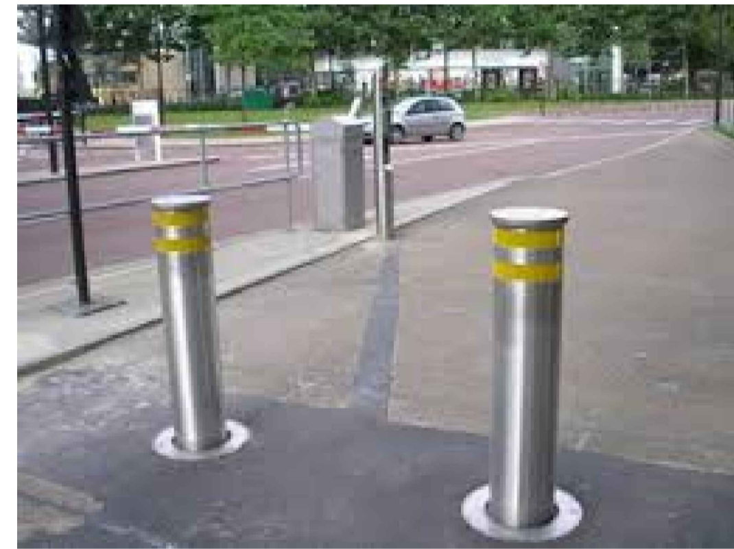
TYPICAL RETRACTABLE BOLLARD