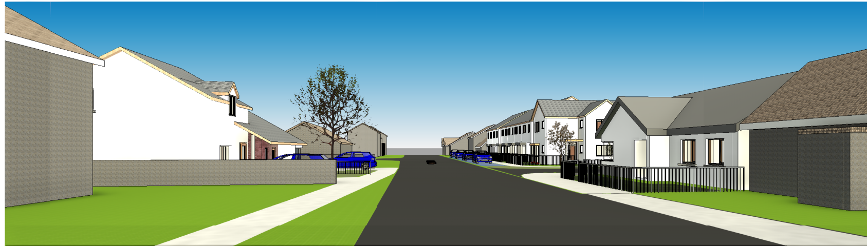
1 01- Perspective View from Canal Road