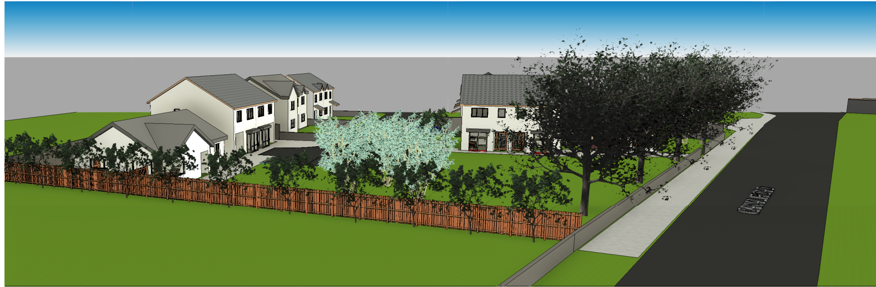
2 07 - Perspective View from Canal Road