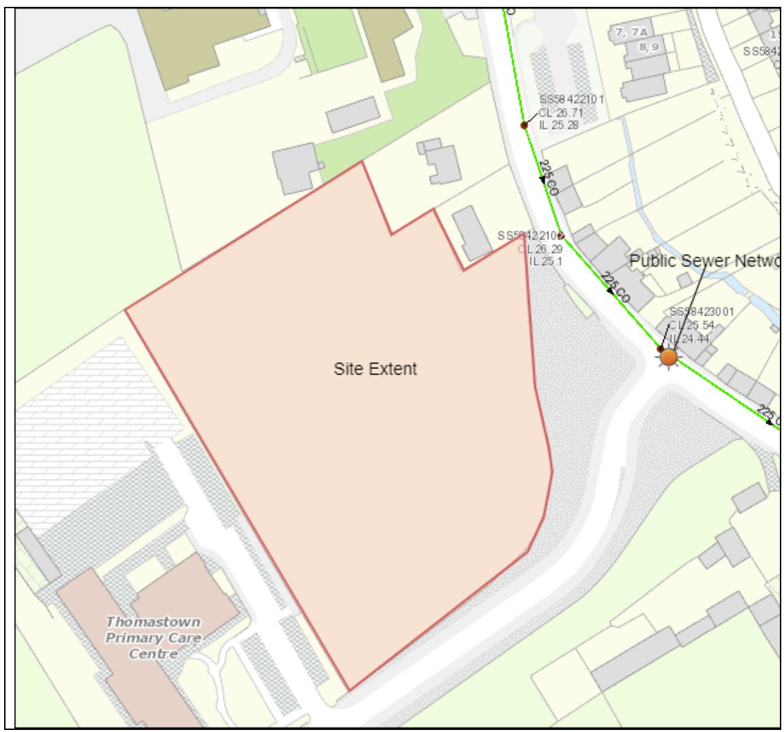
Reproduced from the Ordnance Survey of Ireland by Permission of the Government, License No. 3-3-34

Note: The information provided on the included maps as to the position of Irish Water's underground network(s) is provided as a general guide only. The information is based on the best available information provided by each Local Authority in Ireland to Irish Water.