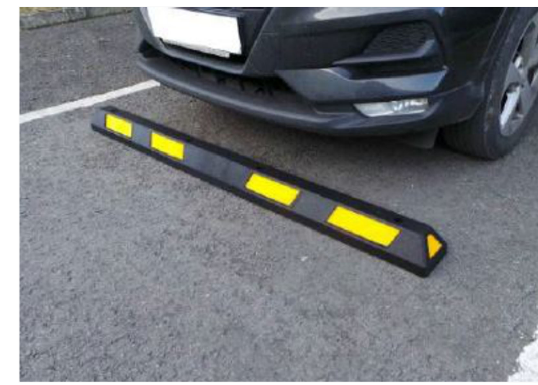
Bolt Down Kerb Blocks