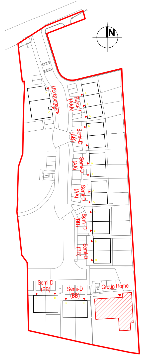
KEY PLAN SCALE 1/1000

NOTES DO NOT SCALE FROM THIS DRAWING. USE FIGURED DIMENSIONS ONLY. VERIFY DIMENSION ON SITE AND REPORT ANY DISCREPANCIES TO KILKENNY COUNTY COUNCIL REP. IMMEDIATELY. DRAWINGS TO BE READ IN CONJUNCTION WITH ALL SPECIFICATIONS AND OTHER DESIGN TEAM ENGINEERING DRAWINGS. ALL CONSTRUCTION WORKS TO COMPLY WITH CURRENT BUILDING REGULATIONS.