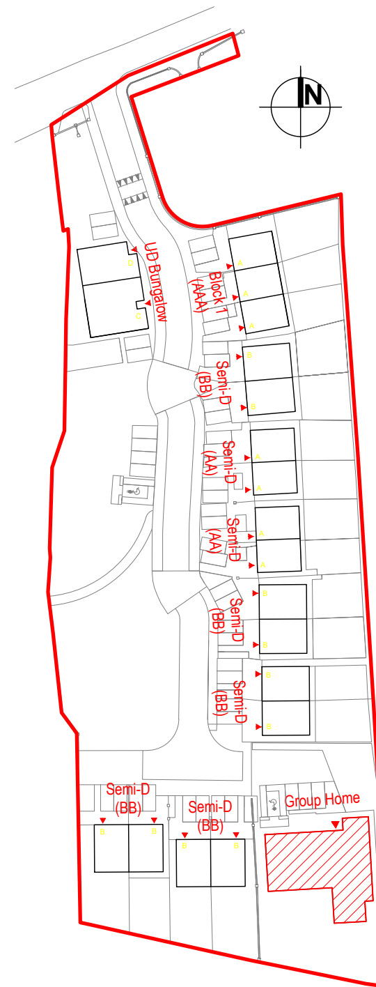
KEY PLAN SCALE 1/1000

NOTES DO NOT SCALE FROM THIS DRAWING. USE FIGURED DIMENSIONS ONLY. VERIFY DIMENSION ON SITE AND REPORT ANY DISCREPANCIES TO KILKENNY COUNTY COUNCIL REP. IMMEDIATELY. DRAWINGS TO BE READ IN CONJUNCTION WITH ALL SPECIFICATIONS AND OTHER DESIGN TEAM ENGINEERING DRAWINGS. ALL CONSTRUCTION WORKS TO COMPLY WITH CURRENT BUILDING REGULATIONS.