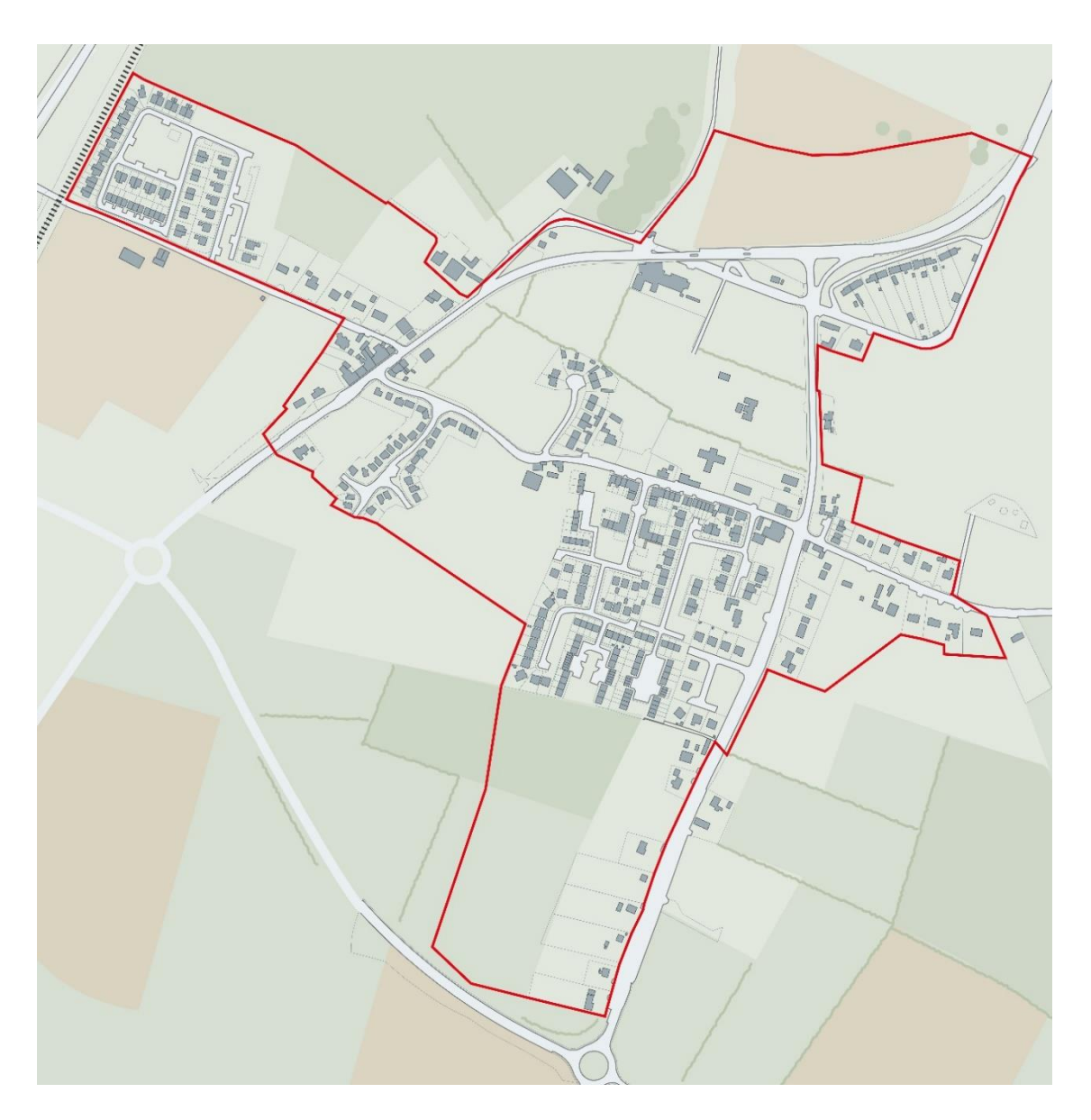
Figure 2. Paulstown site boundary