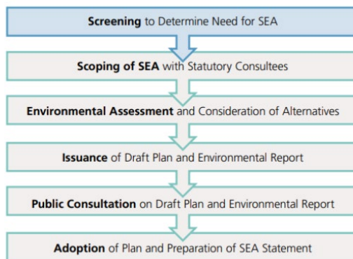
Figure 2.1: Screening in the overall SEA Process (Source: EPC, Good Practice Guidance on Screening, 2021).