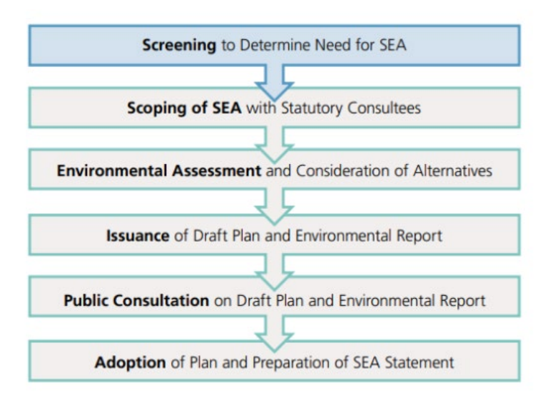
Figure 2.1: Screening in the overall SEA Process (Source: EPC, Good Practice Guidance on Screening, 2021).