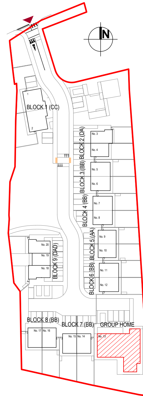
○ KEY PLAN SCALE 1/1000

NOTES DO NOT SCALE FROM THIS DRAWING. USE FIGURED DIMENSIONS ONLY. VERIFY DIMENSION ON SITE AND REPORT ANY DISCREPANCIES TO KILKENNY COUNTY COUNCIL REP. IMMEDIATELY. DRAWINGS TO BE READ IN CONJUNCTION WITH ALL SPECIFICATIONS AND OTHER DESIGN TEAM ENGINEERING DRAWINGS. ALL CONSTRUCTION WORKS TO COMPLY WITH CURRENT BUILDING REGULATIONS.