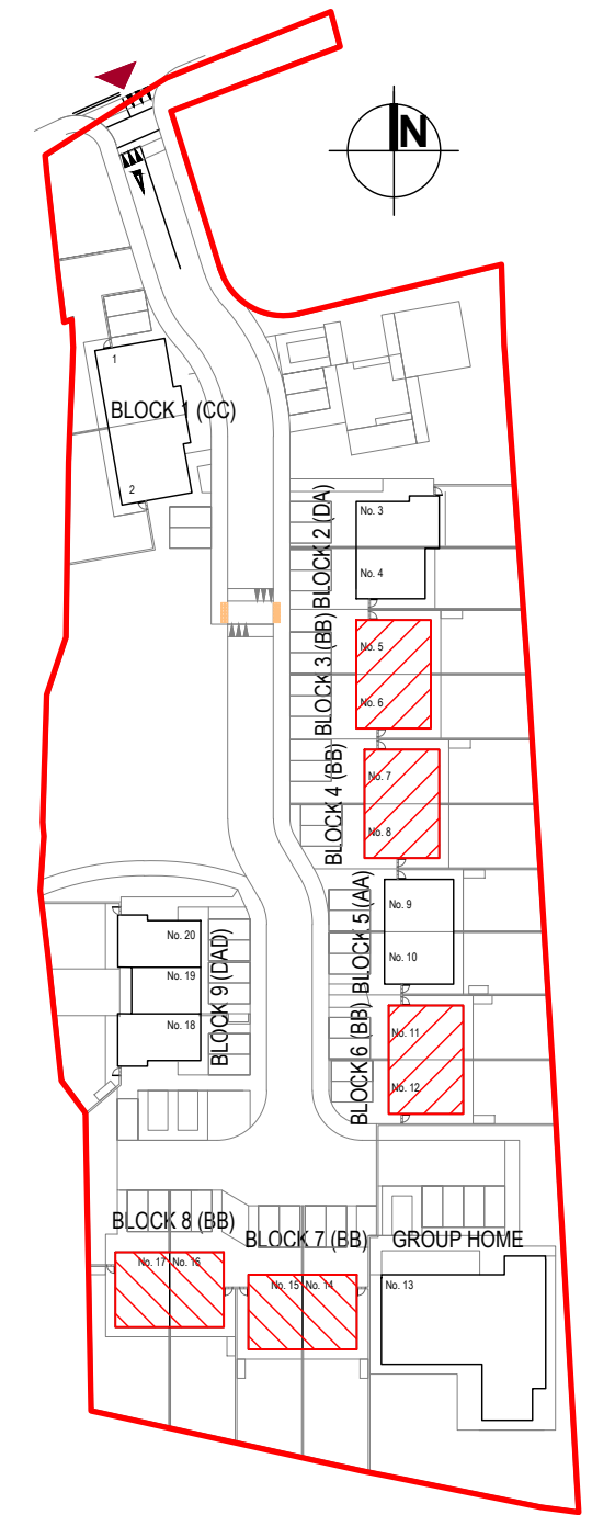
KEY PLAN SCALE 1/1000

NOTES DO NOT SCALE FROM THIS DRAWING. USE FIGURED DIMENSIONS ONLY. VERIFY DIMENSION ON SITE AND REPORT ANY DISCREPANCIES TO KILKENNY COUNTY COUNCIL REP. IMMEDIATELY. DRAWINGS TO BE READ IN CONJUNCTION WITH ALL SPECIFICATIONS AND OTHER DESIGN TEAM ENGINEERING DRAWINGS. ALL CONSTRUCTION WORKS TO COMPLY WITH CURRENT BUILDING REGULATIONS.