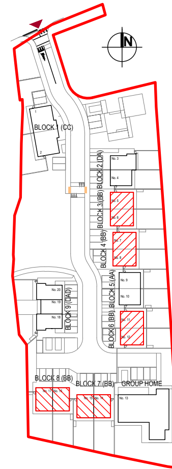
KEY PLAN SCALE 1/1500