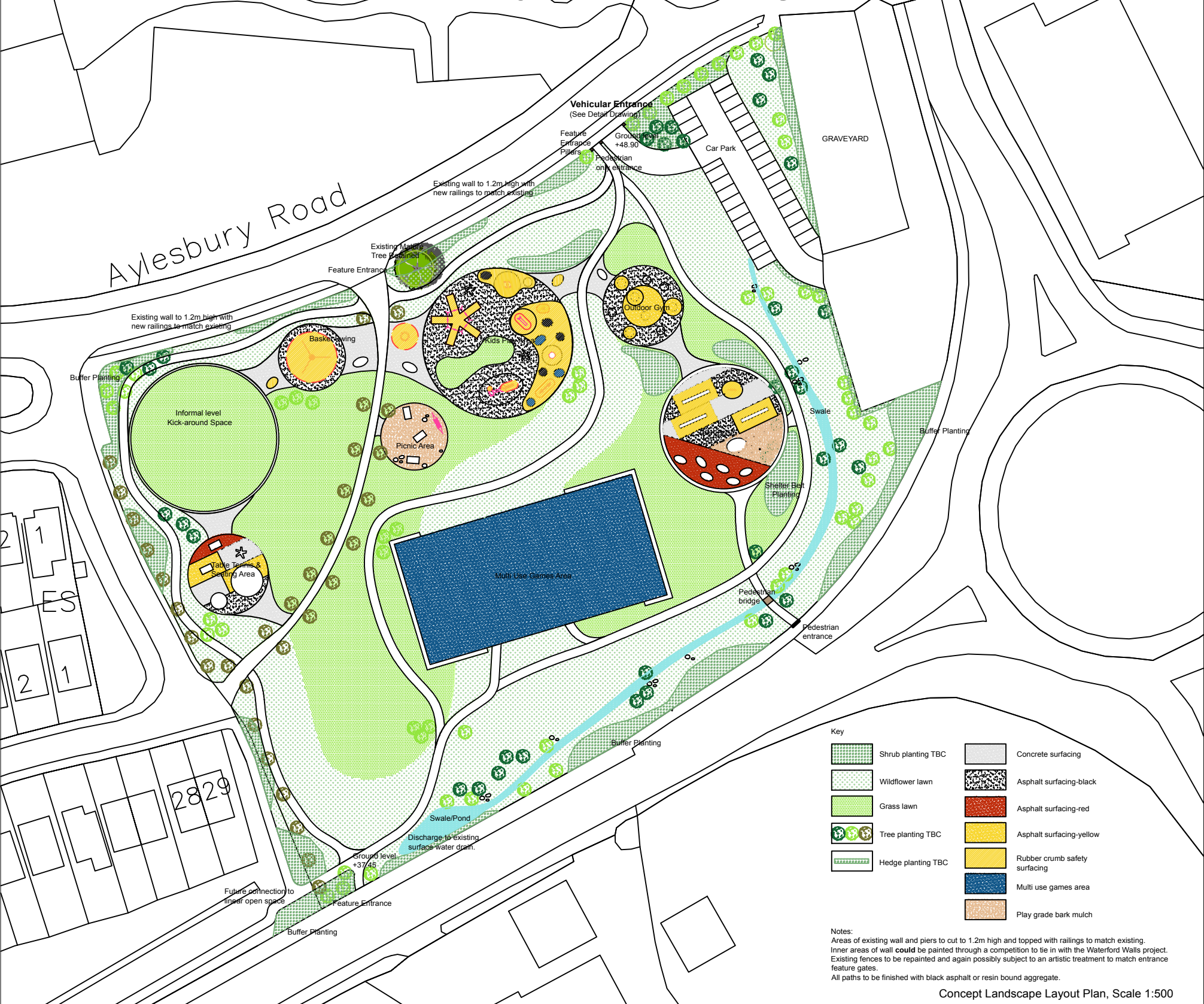
Example images indicative only.