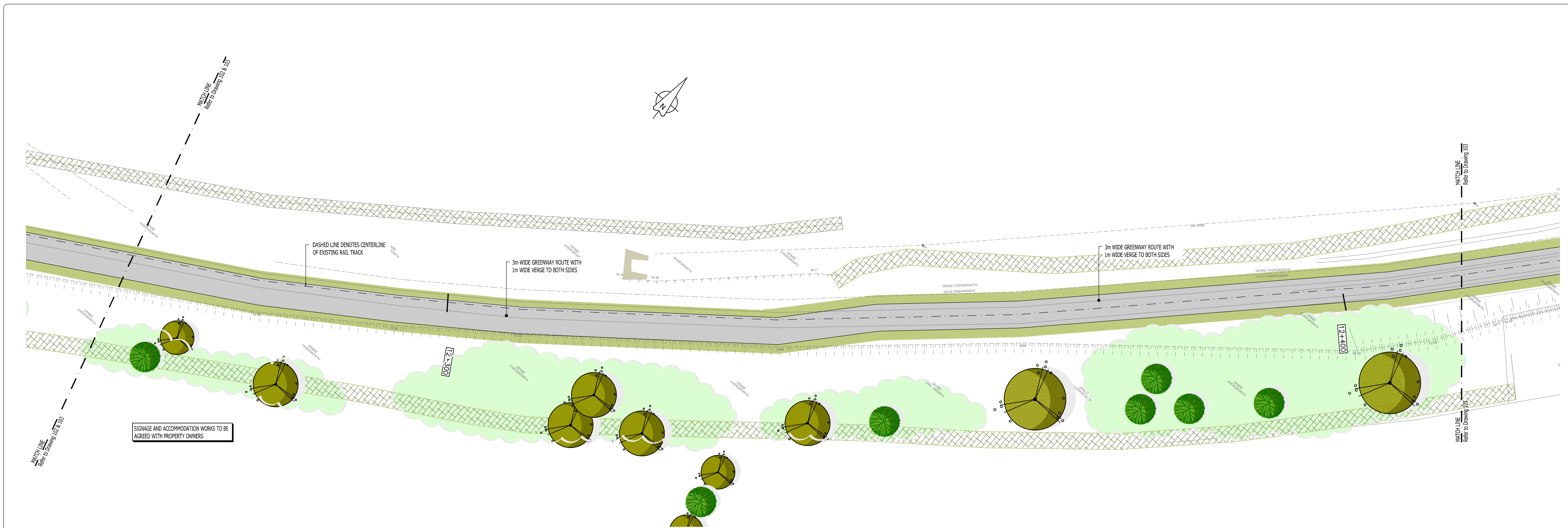
WATERFORD TO NEW ROSS GREENWAY (CHAINAGE 12.26km TO 12.4km)