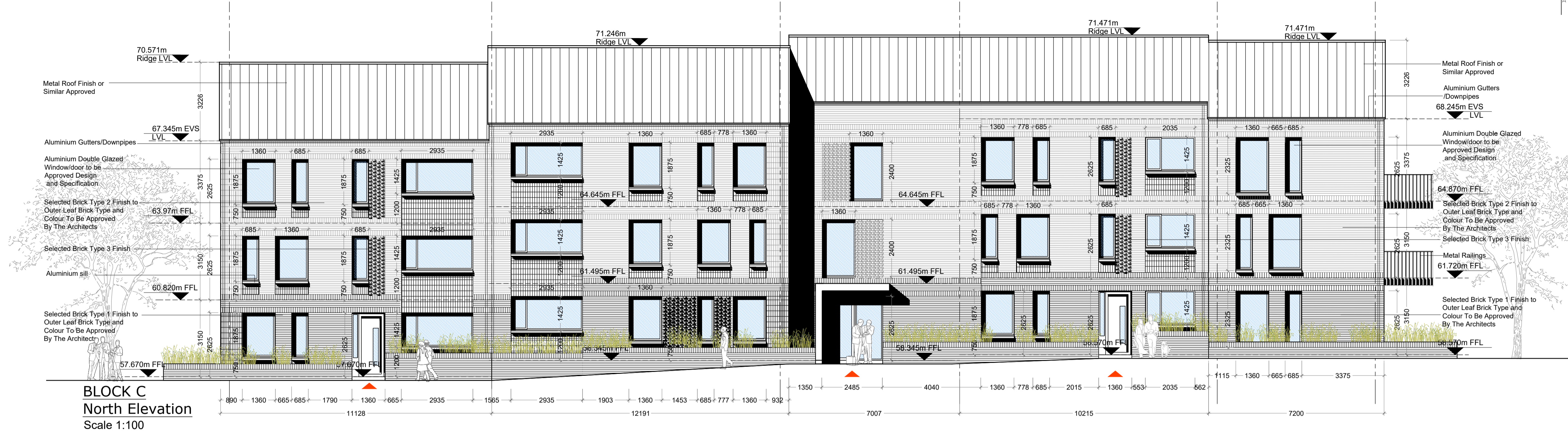
BLOCK C North Elevation Scale 1:100