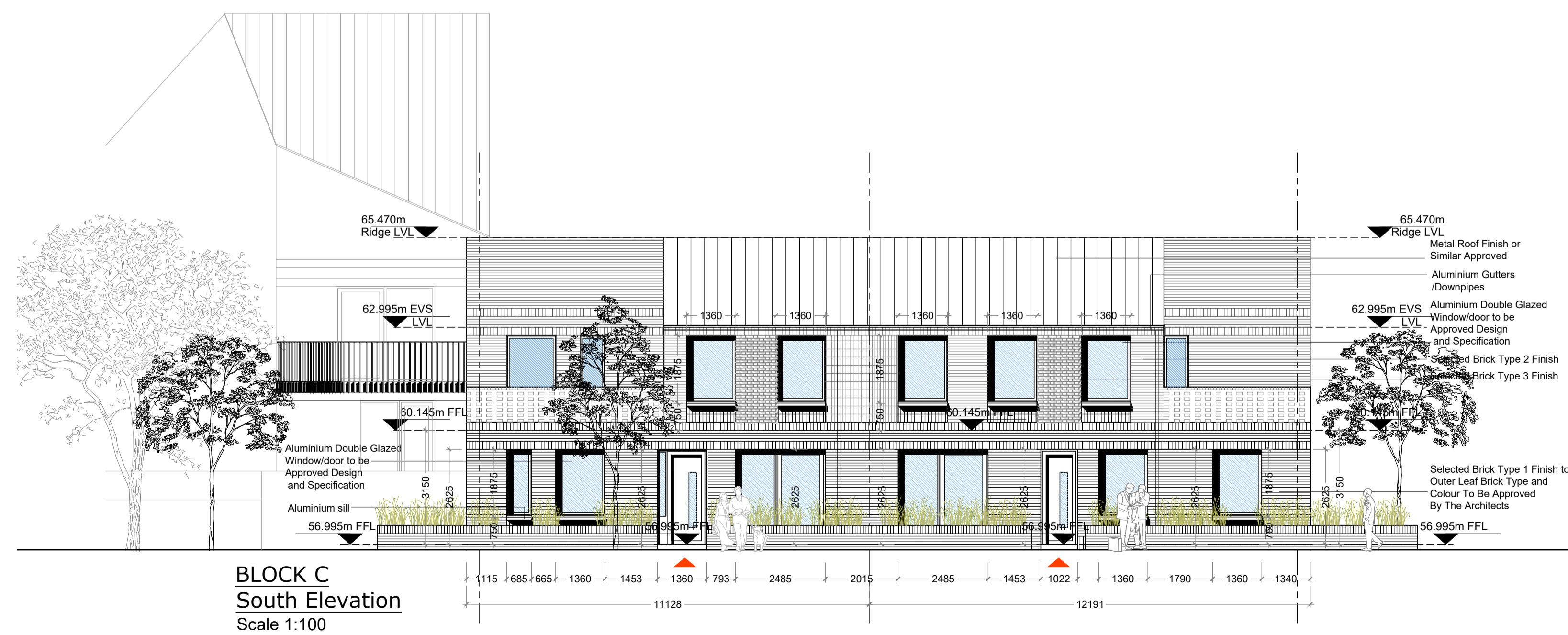
BLOCK C South Elevation Scale 1:100