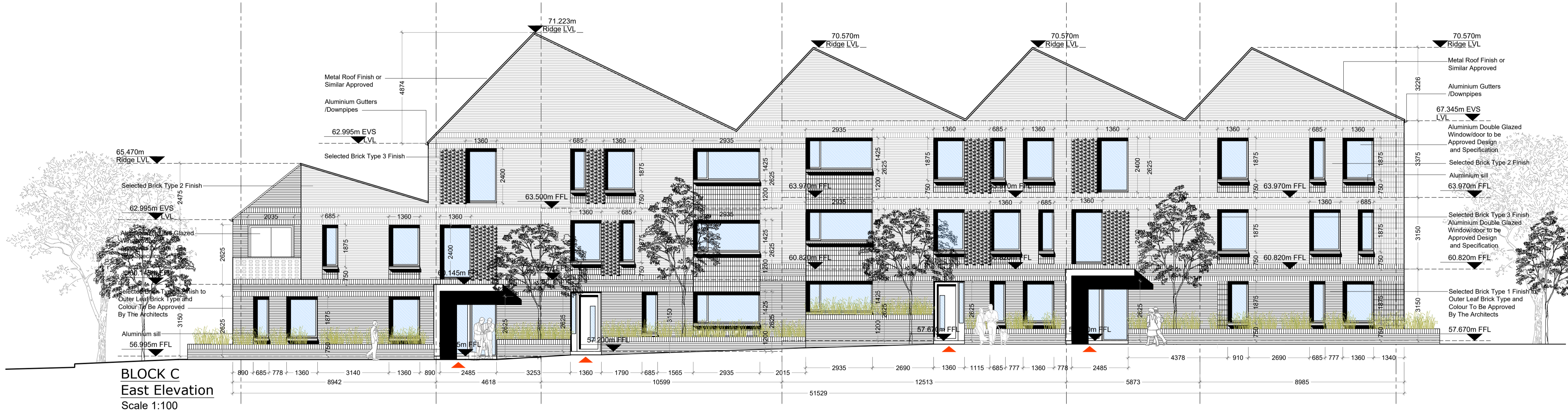
BLOCK C East Elevation Scale 1:100