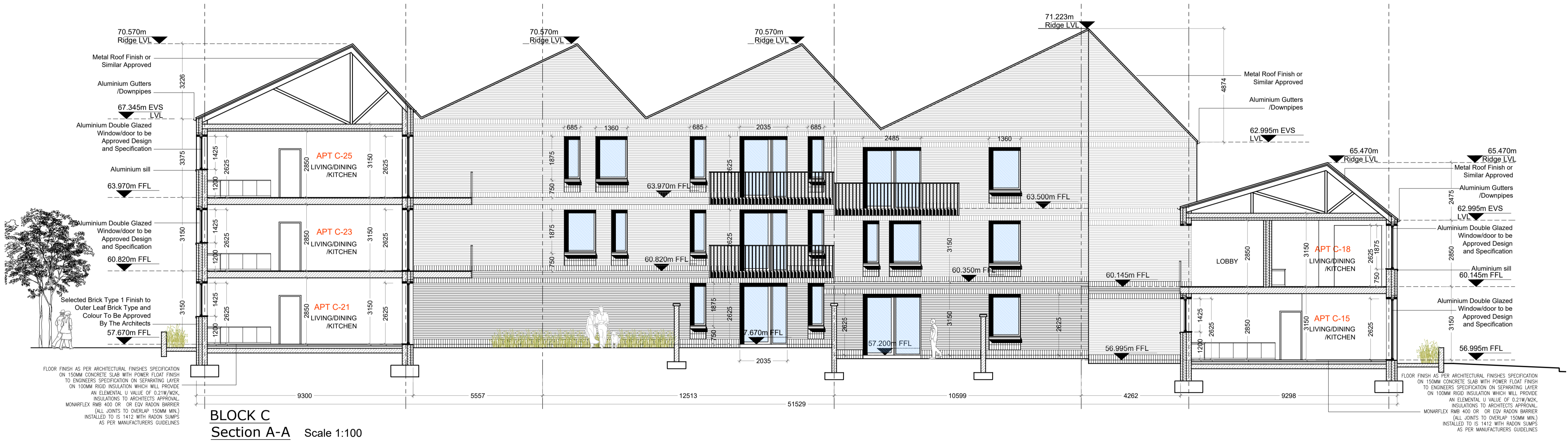
BLOCK C Section A-A Scale 1:100