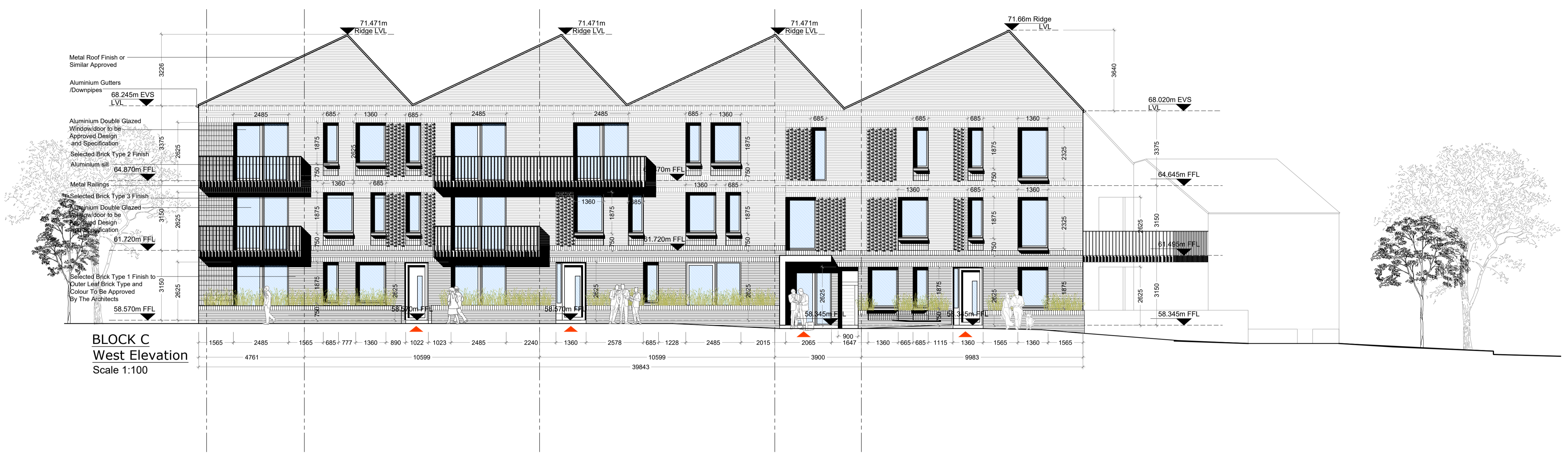
BLOCK C West Elevation Scale 1:100