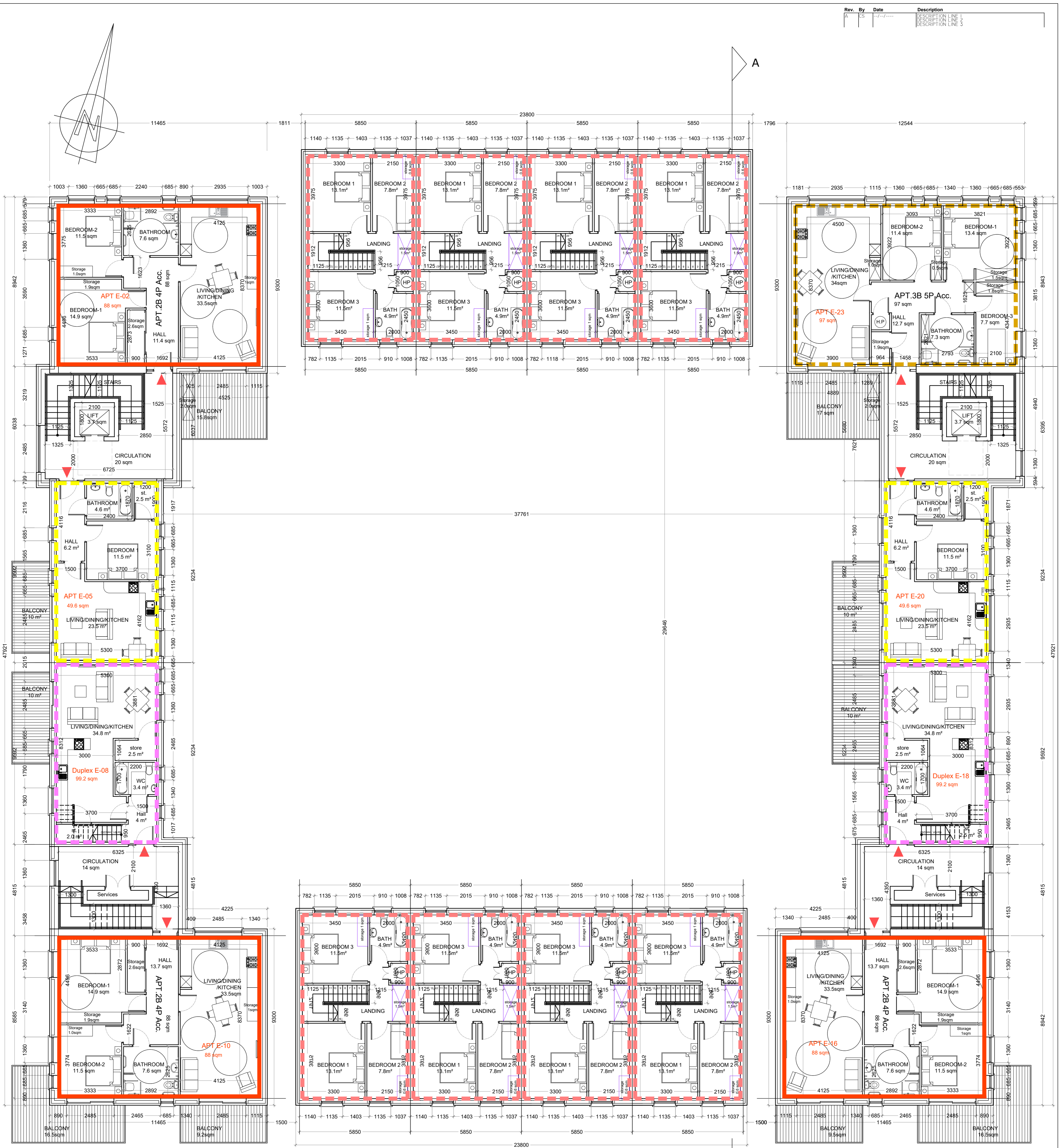
BLOCK E First Floor Plan Scale 1:100