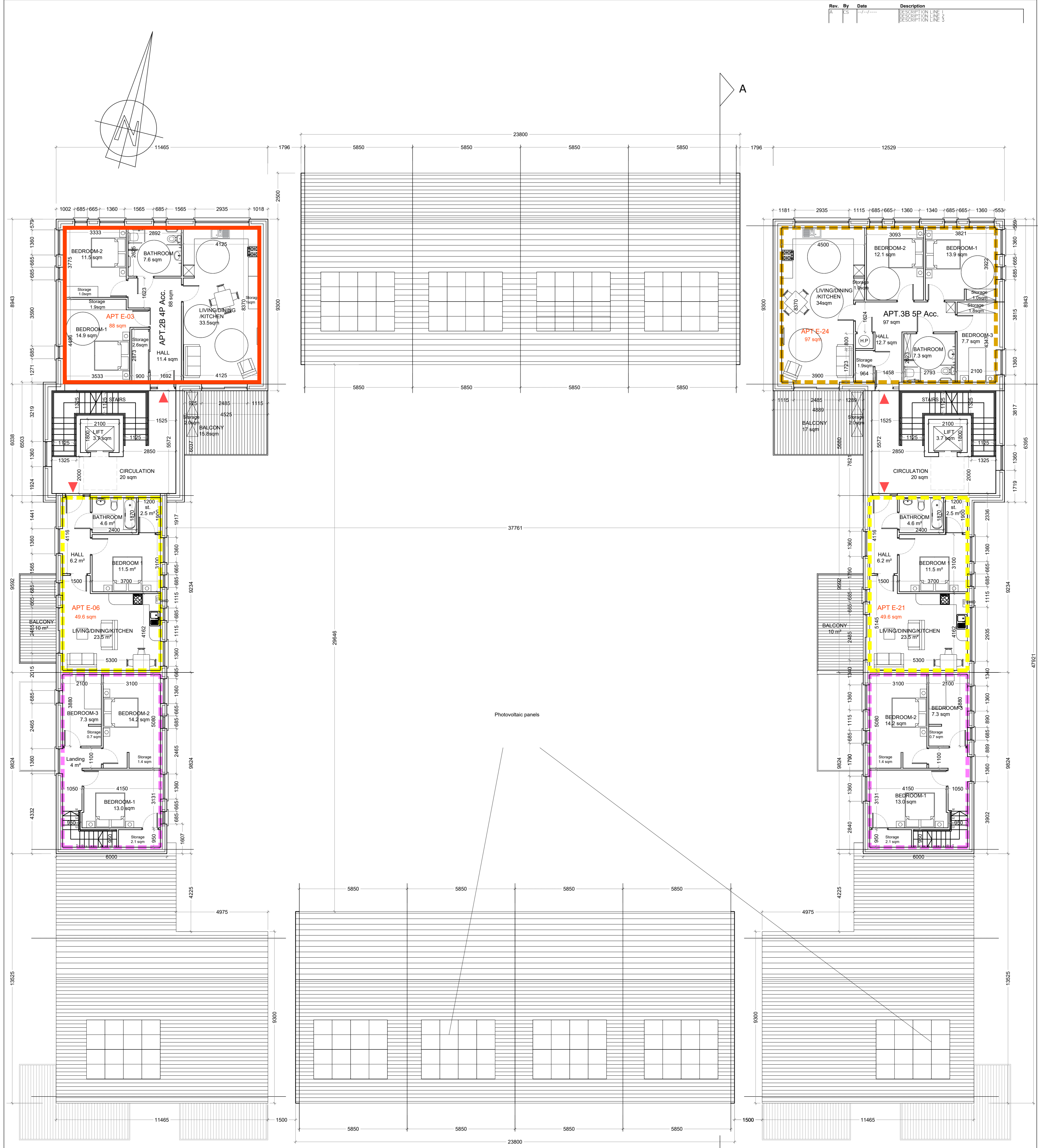
BLOCK E Second Floor Plan Scale 1:100