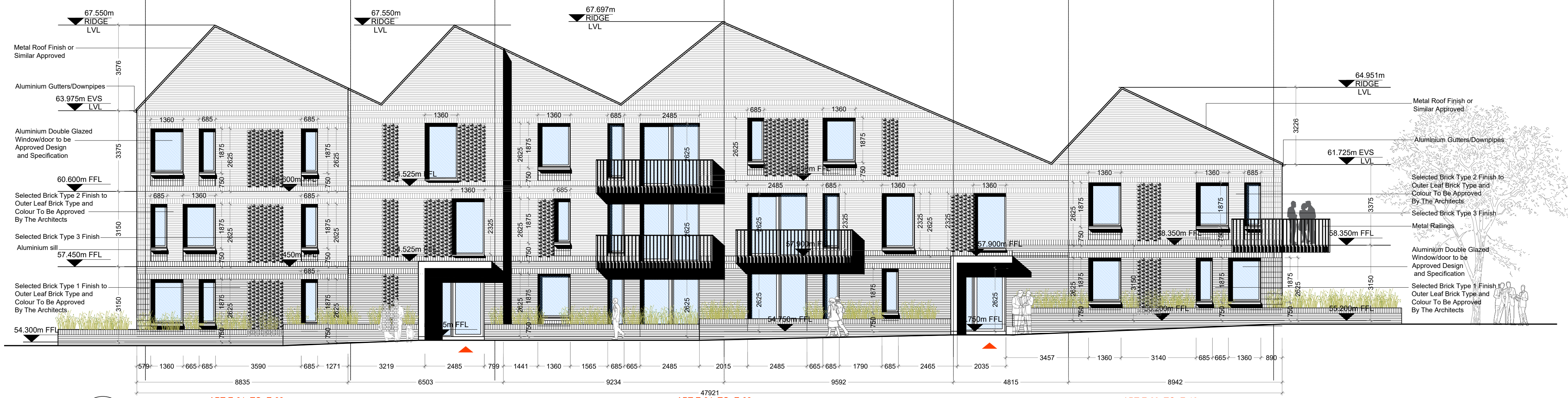
01 West Elevation 1:100 200 Crockers Hill (BLOCK E)