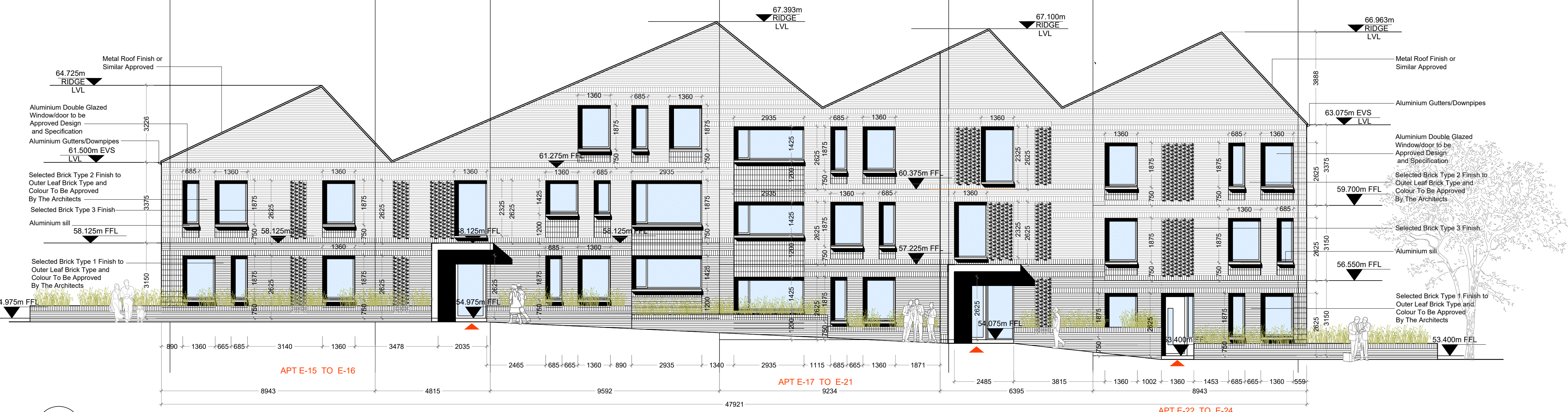
03 East Elevation 1:100 200 Crockers Hill (BLOCK E)