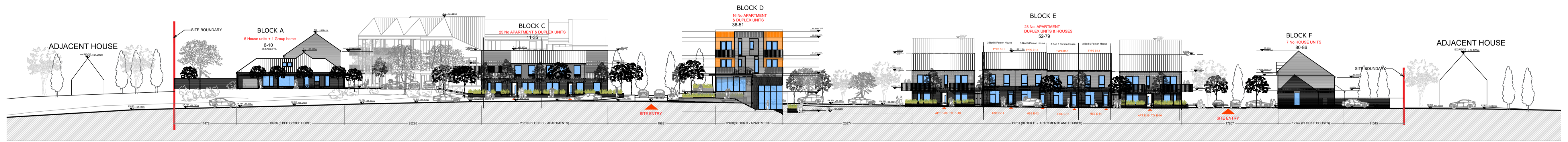
SITE SECTION 1-1 Scale 1/500