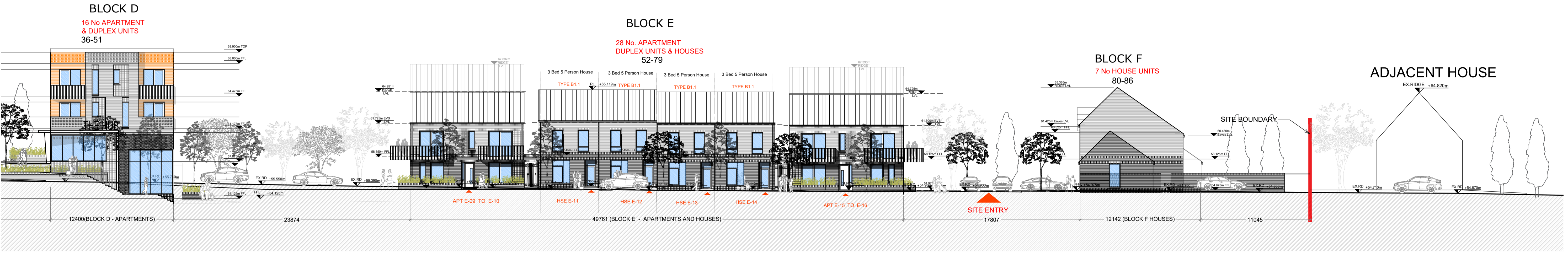
SITE SECTION 1-1 (Part 2) Scale 1/200