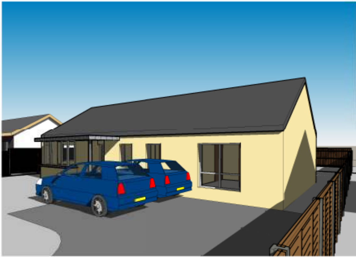
1 Perspective View 1