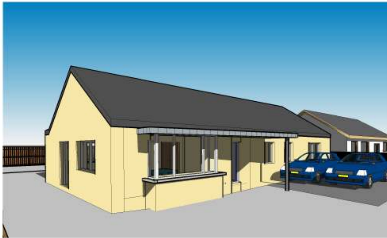
3 Perspective View 2