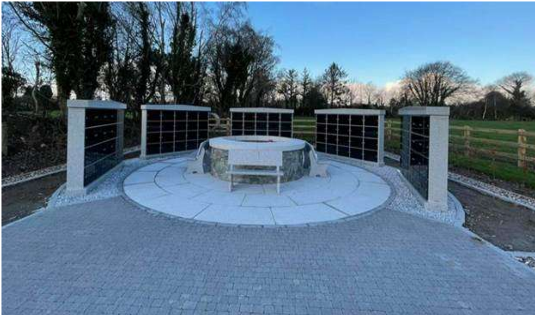
Recently Opened Columbarium Wall Garden Killarney (December 2020)

specifically for that purpose. The memorial plaque is engraved with an inscription. Each niche can typically accommodate two cremated remains.