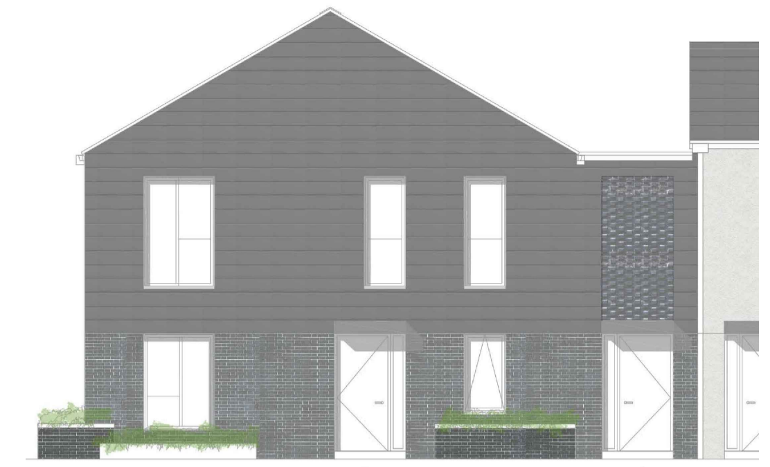
MATERIALITY TYPE 1 – BRICK OR RENDER PLINTH WITH CLADDING TO FIRST FLOOR (REFER TO ELEVATIONS FOR LOCATIONS) SCALE 1:100