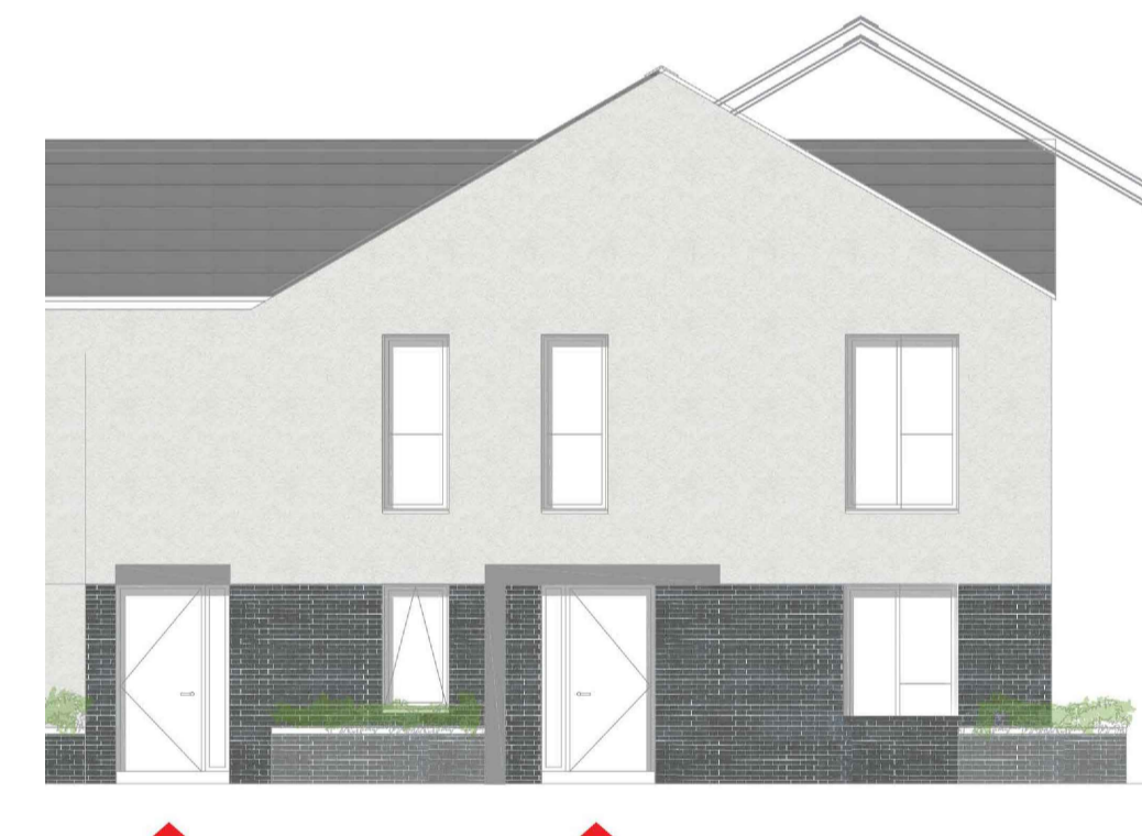
MATERIALITY TYPE 3 – BRICK PLINTH WITH RENDER TO FIRST FLOOR