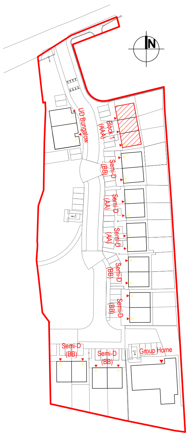
KEY PLAN SCALE 1/1000

NOTES DO NOT SCALE FROM THIS DRAWING. USE FIGURED DIMENSIONS ONLY. VERIFY DIMENSION ON SITE AND REPORT ANY DISCREPANCIES TO KILKENNY COUNTY COUNCIL REP. IMMEDIATELY. DRAWINGS TO BE READ IN CONJUNCTION WITH ALL SPECIFICATIONS AND OTHER DESIGN TEAM ENGINEERING DRAWINGS. ALL CONSTRUCTION WORKS TO COMPLY WITH CURRENT BUILDING REGULATIONS.