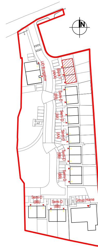
KEY PLAN SCALE 1/1500