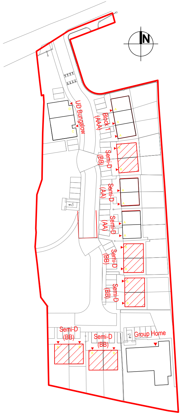
KEY PLAN SCALE 1/1000