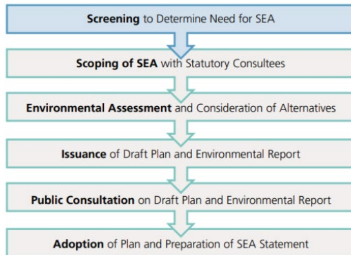
Figure 2.1: Screening in the overall SEA Process (Source: EPC, Good Practice Guidance on Screening, 2021).