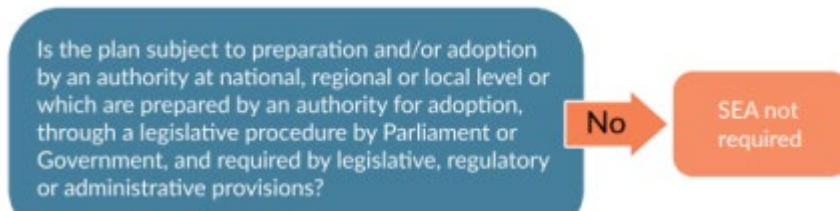
Figure 6.1: Outcome of Stage 1 Applicability Screening, as adapted from the research report Development of Strategic Environmental Assessment (SEA) Methodologies for Plans and Programmes in Ireland. Source (Scott and Marsden, 2001).