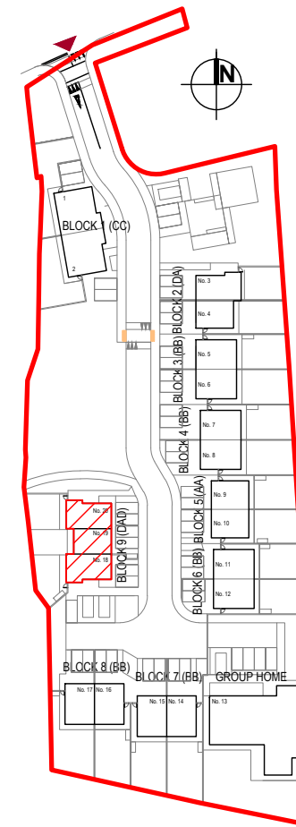
KEY PLAN SCALE 1/1500

NOTES DO NOT SCALE FROM THIS DRAWING. USE FIGURED DIMENSIONS ONLY. VERIFY DIMENSION ON SITE AND REPORT ANY DISCREPANCIES TO KILKENNY COUNTY COUNCIL REP. IMMEDIATELY. DRAWINGS TO BE READ IN CONJUNCTION WITH ALL SPECIFICATIONS AND OTHER DESIGN TEAM ENGINEERING DRAWINGS. ALL CONSTRUCTION WORKS TO COMPLY WITH CURRENT BUILDING REGULATIONS.