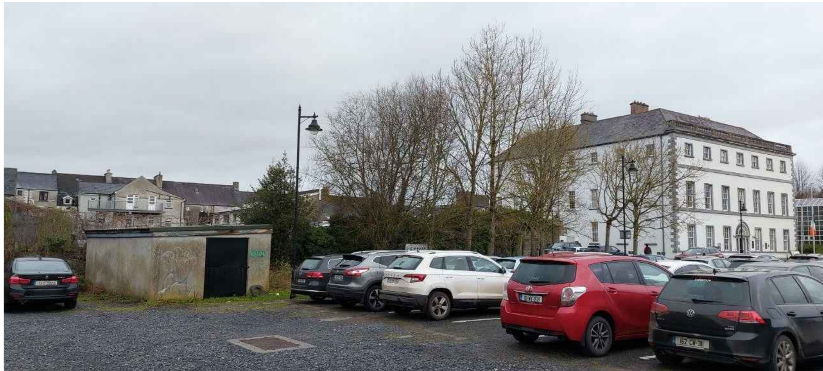
EXISTING SITE LOOKING NORTH WEST TOWARDS CITY HALL