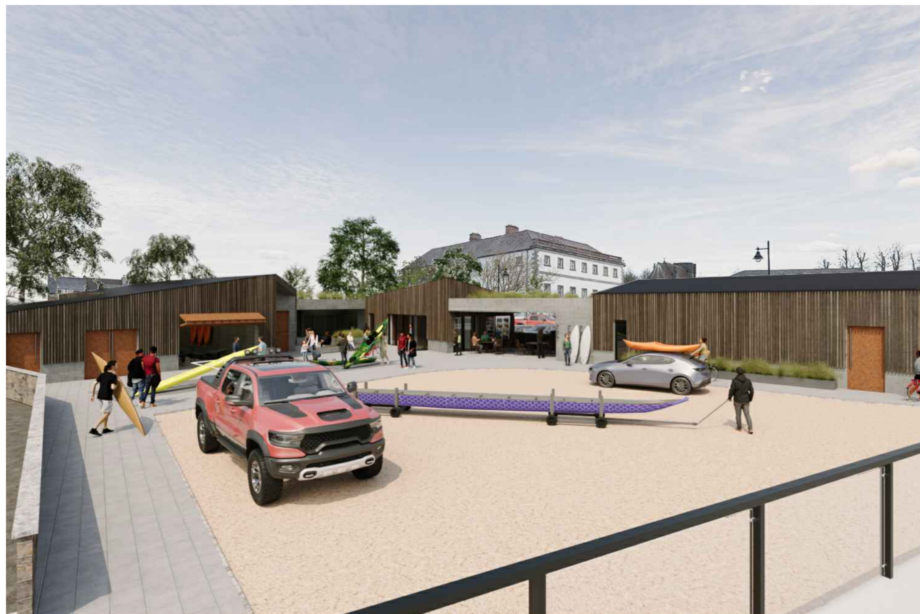
PROPOSED WATER SPORTS ACTIVITY HUB