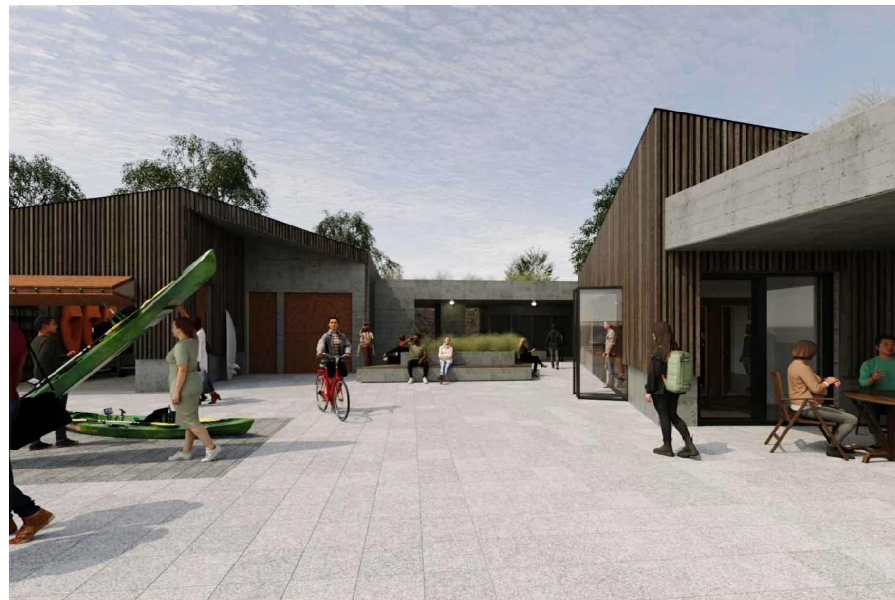
ZOOMED VIEW OF CENTRAL SPACE / MATERIALS